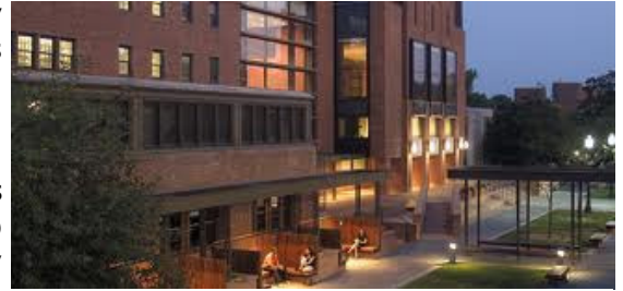
Raether Library and Information Technology Center

In order to ensure a broad liberal arts education, Trinity requires the students to take at least one course in five areas of Humanities, Arts, Social Sciences, Natural Sciences and Numerical and Symbolic Reasoning by the time they graduate. Therefore, many of Trinity's graduates get into excellent grad schools, such as Harvard, MIT, Stanford and so on, which is confirmed by the national rankings: Trinity is among the top 50 "feeder schools" for top graduate programs, as stated by The Wall Street Journal .