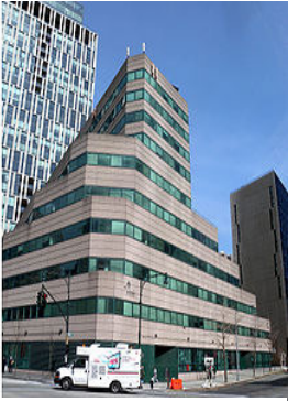
Manhattan vertical campus

Of course the academic programs are exceptional, with competitive courses in health sciences, business, education, and professional studies. The average class size is 26 students and the educational emphasis is on practical experience. The range of internships available to students is mind-blowing: from the New York Times, Yankees, UBS, United Nations, MTV, and HBO to smaller boutique companies or local hospitals and schools, there is an abundance of choice. The graduate programs are also extensive, including a law school and MBA program.