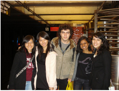
Trip to New York City

My first semester at Trinity has provided me with a completely different perspective on human interactions at a college level. I share a dorm with many of my classmates. This allowed us to bond faster than usual, by performing daily activities together – going to breakfast, discussing class material or simply taking a walk together around campus in the evening. My seminar also played an important role in helping me form these bonds – our professor (who is also our academic advisor) organized several events to help us get to know each other better, and here I'd like to mention a canoe trip on the Farmington river which is a 40-minute ride away from campus.